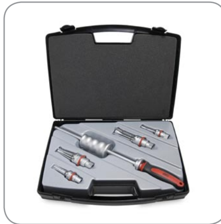
TMIP 7-28 Supplied with 4 extractors covering bore diameters from 7 to 28 mm (0,28 to 1,1 in)