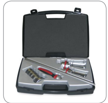
TMIP 30-60 Supplied with 2 extractors covering bore diameters from 30 to 60 mm (1,2 to 2,4 in)